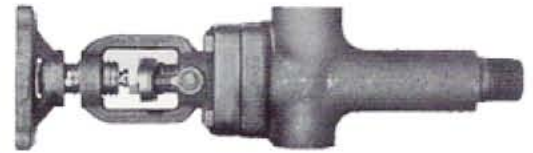
Q76 BL Gauge Valves

Renewable Seat: The removable seat may be replaced.